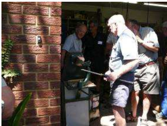
At, explaining the basics of the bowl gauge