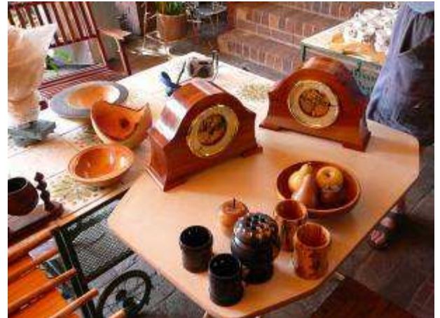
More of the excellent pieces made this last month

At this meeting we discussed the following, of which everybody is once again reminded: