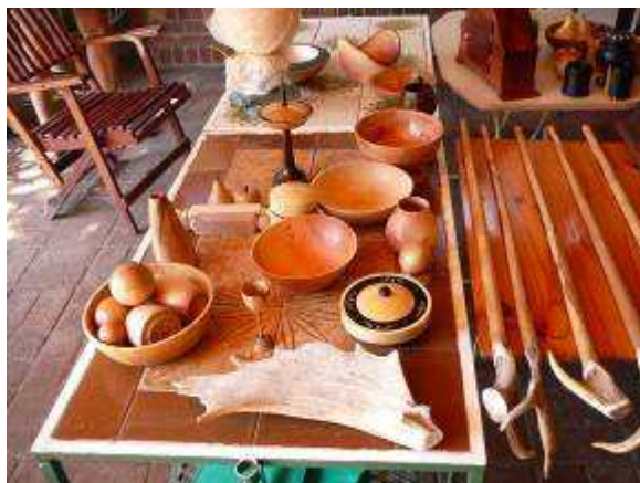
Some of this month's homework

Op hierdie vergadering was daar sommer 'n mooi verskeidenheid items wat deur die vorige maand gemaak is. Daar het ook baie nuttige gesprekke voortgevloei uit al die suksesse en die foute wat deur die lede gemaak is. Die les wat sekerlik hieruit te leer is, is dat 'n mens tog maar by mekaar kan leer en hoe langer tyd jy hiermee sou spandeer des te meer sal jy daarby baat vind. (Die lede wat nog nie deel is van 'n sub-groep nie kan tog maar poog om ook deel te neem. Dit is lekker om so saam te werk ens en 'n mens leer deurgaans by die ander. -Red)