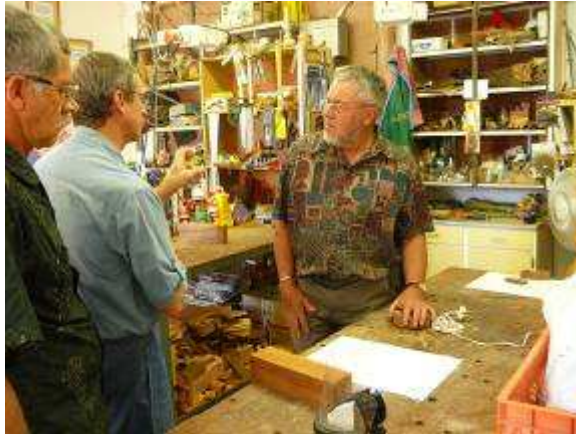
Isak vertel hoe om 'n lamp te draai